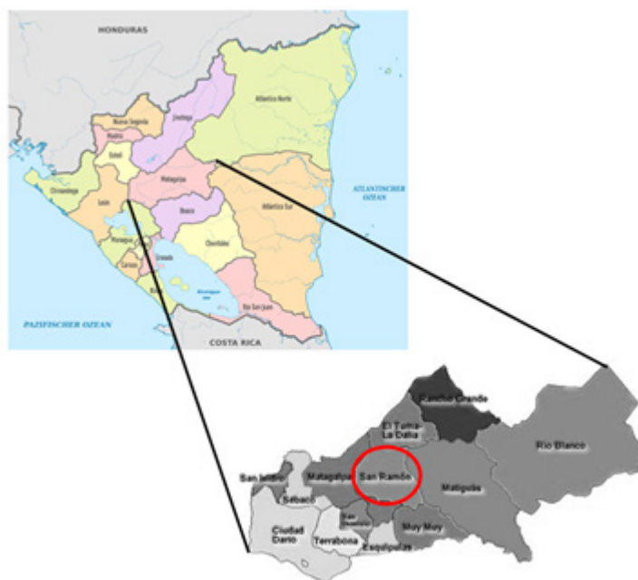
Figure 1. Zone in study

The universe of study was 5 653 households, located in the urban and rural area of the municipality of San Ramón. The urban area is divided into 9 neighborhoods and the rural area formed by 11 towns with 51 communities.